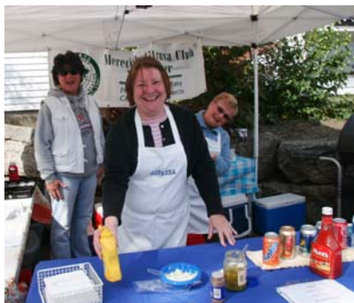
2009 Meredith event photos!